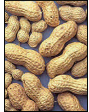
Peanuts are one of the top eight foods that cause food allergies.

Learn more at http://blog.foodallergy.org/2014/07/14/a-new-look-at-food-allergy-bullying/ .