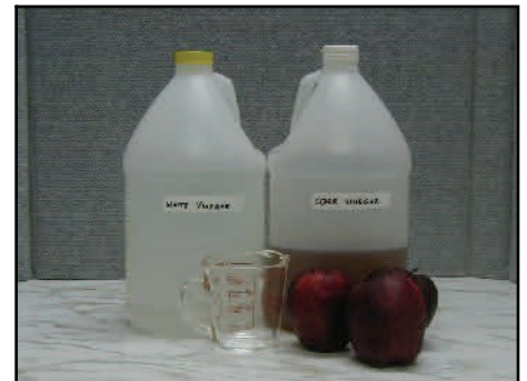
For more on pickling, see Preserving Cucumbers at www.ksre.ksu.edu/bookstore/pubs/mf1184.pdf

For pickling foods, use food grade vinegar that has 5 percent acidity stated on the label. Common types used include apple cider vinegar and distilled white vinegar.