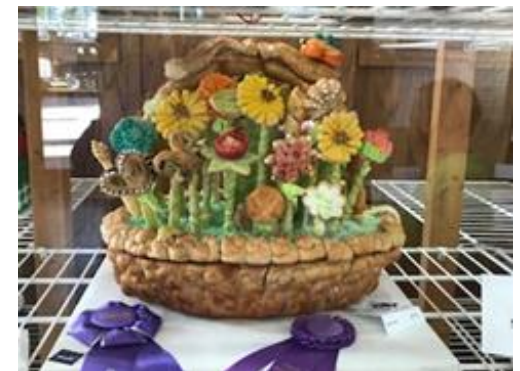
2018 STATE FAIR ENTRIES